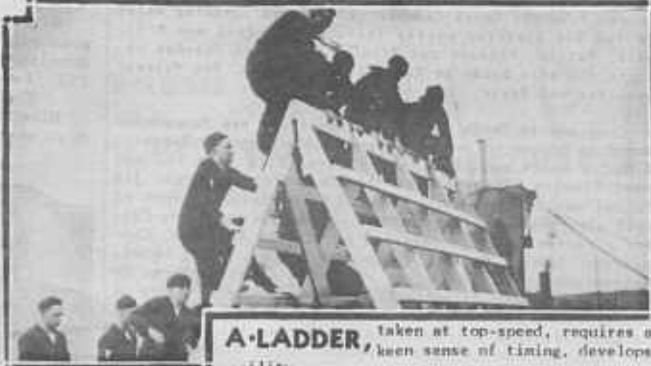
A-LADDER , taken at top-speed, requires a keen sense of timing, develops agility.