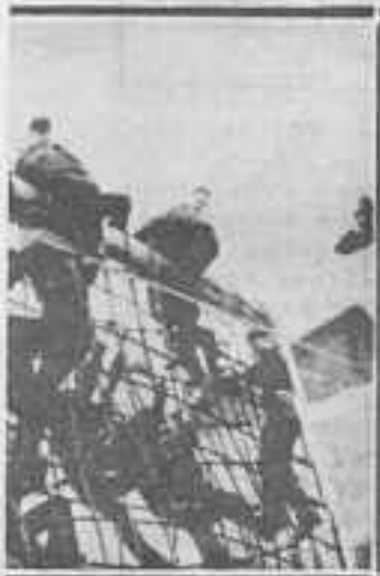
approximates actual conditions in abandoning ship. net climb.