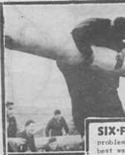
SIX-F problem. best way