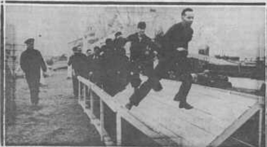
DECK of a listing ship might be something like this straddle run.