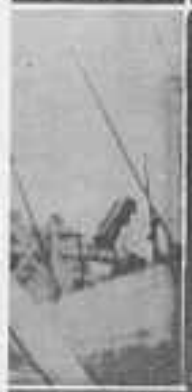
G eight-foot wall development. The boys' trick is getting over. Cost is nothing at