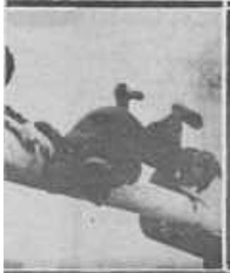
DOT RAIL presents a tough you just got over the you can.