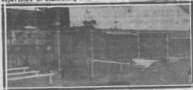
DOWN THE BACKSTRETCH go AGs as they negotiate difficult hurdles that confront them in the toughening-up process.