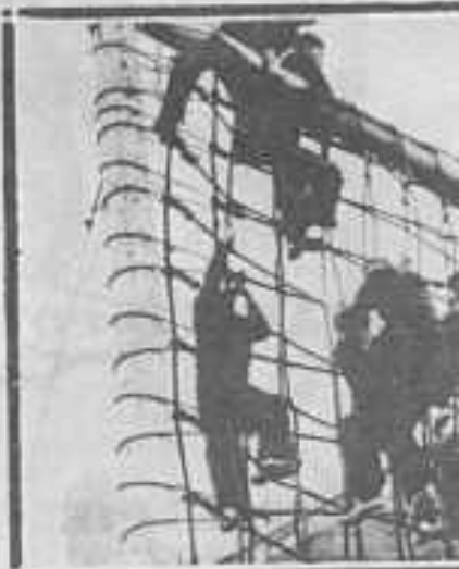
CARGO NET CLIMB