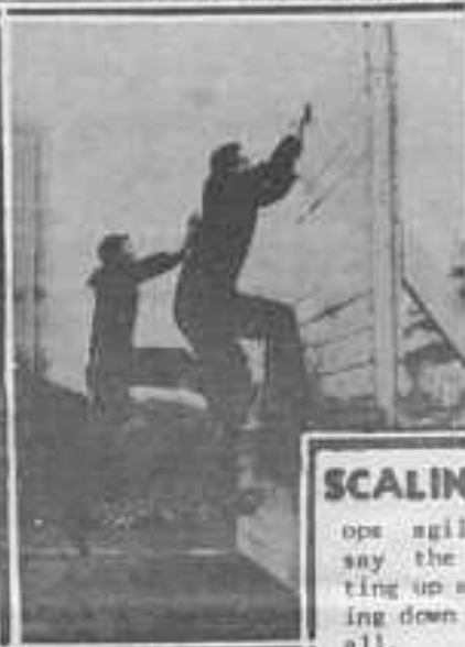
SCALING ope skill say the ting up a ing down all.